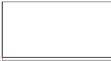
3/8" Square Flap Envelope

Please contact your CSR for final approval before production.